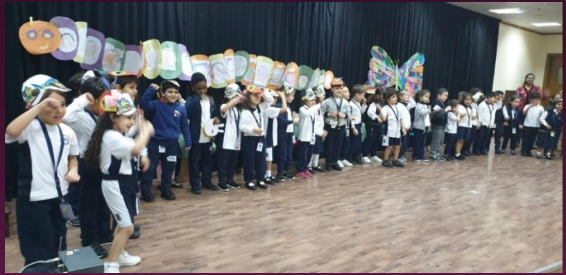
Reception Red and Reception Silver's performance was based on the book: 'The Hungry Caterpillar'.