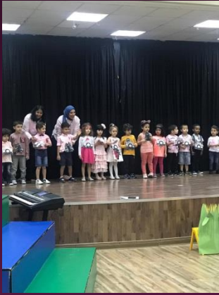
KG Orange's performance was based on the book: 'We're going on a bear hunt'.