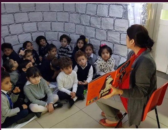
KG Yellow is enjoying story time in the igloo.