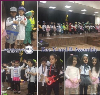
Reception Yellow and Reception Blue's performance was based on the topic; 'Professions'.