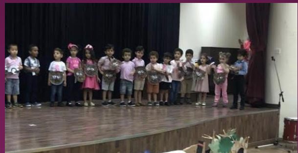
KG Silver's performance was based on the book: 'We're going on a bear hunt'.